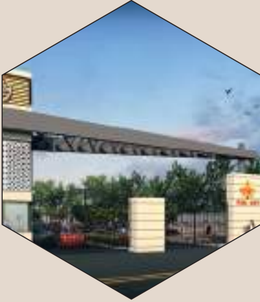
MODERN ENTRY GATE