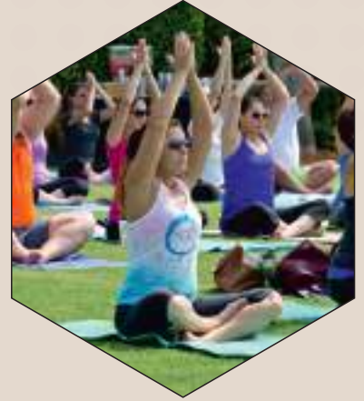
YOGA & CENTRAL PARK