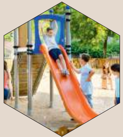
KIDS PLAY GROUND